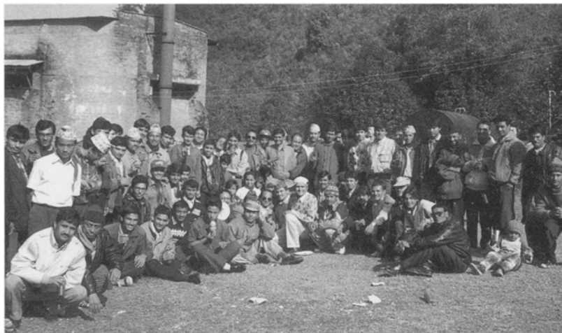
FIGURE 3 Community members meet to discuss a forest-related conflict in a formal process of conflict resolution in Pawoti village, Dolakha District, in 1999. This meeting was organized by the local Village Development Committee. Typically, women are absent.