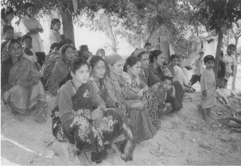
FIGURE 2 Women of the Brahmin and Chhetri castes in Pawoti village, Dolakha District, discuss a dispute over a drinking water source in order to settle the conflict between two communities informally.

politicians use FUGs as a platform for political gain. Conflict between the Federation of Forest Users and the Forest Department became severe when the government took over some of the authority and responsibility granted by the Forest Act to the users of community forests.