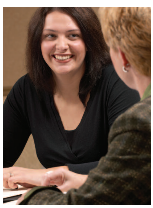
Effective organizational managers strategically hire, support, and retain good teachers while developing or removing less effective ones.

In another study, we use observations of how principals use time rather than reports of their efficacy. Our findings remain consistent. We shadowed principals for full school days, recording how they spent their time in fiveminute intervals. We find that when principals spend more time on organizational management activities, school outcomes are better, including student test-score gains and positive